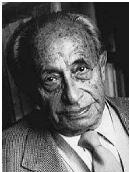
Figure 3 – The philosopher Hans Jonas (1903-1993)

Act in a way that the consequences of your actions are compatible with the permanency of true human life on Earth.