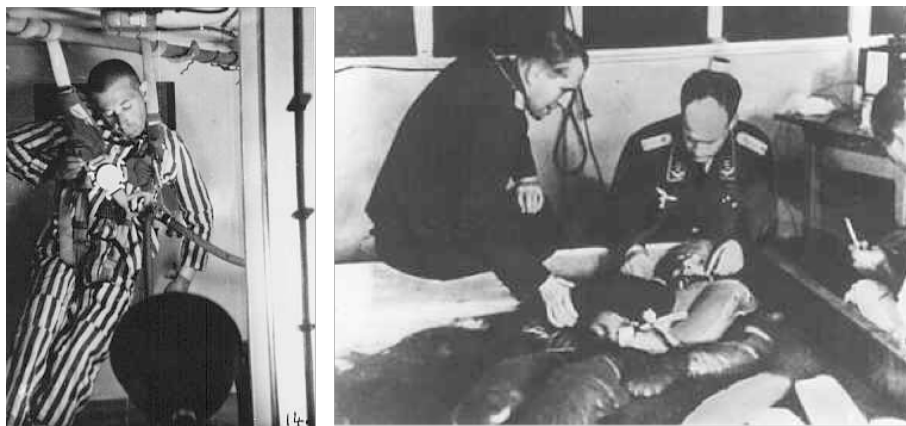
Figure 1 – Scientific experiments carried out at the Dachau Concentration Camp for the German air force.

Examples are the experiments by the Nazi doctors. For example, Sigmund Rascher (1909-1945) ( Wikipedia ) was a medical doctor who conducted scientific experiments according to the medical standards of the time (Figure 1). The experiments were driven by the request of the German army to rescue the pilots who were shot down over the sea and were frequently dying in the cold water, and to do research on the effects of high altitude on plane pilots. Rascher was a member of the Ahnenerbe, the science organisation of the SS ( Wikipedia ) and his research was funded by predecessor organisation of the DFG. The experiments were unethical because the subjects were forced to participate and they were inmates of the concentration camps in Dachau and Auschwitz. Many test persons died or were killed after the experiments.